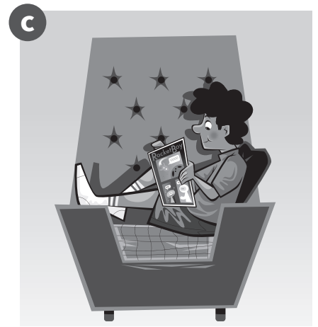
read a comic