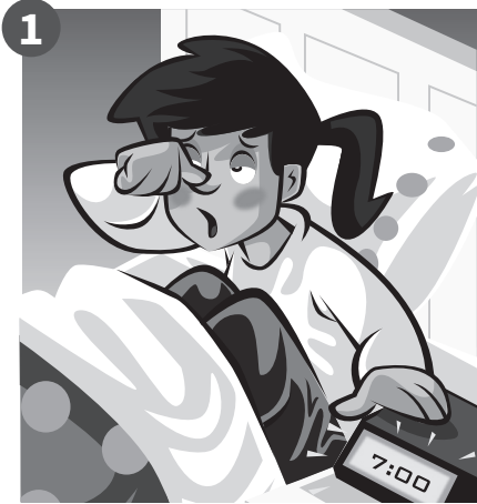
I wake up at seven o'clock .

have a shower get dressed brush my teeth wake up have breakfast get up