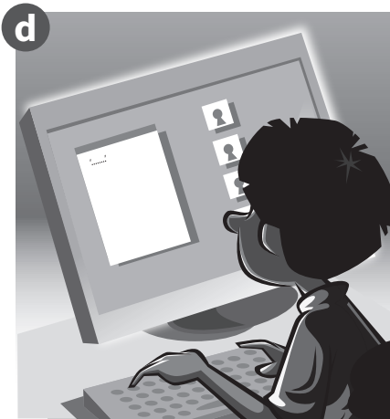
write an email