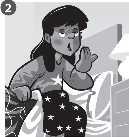
I _____ at _____.