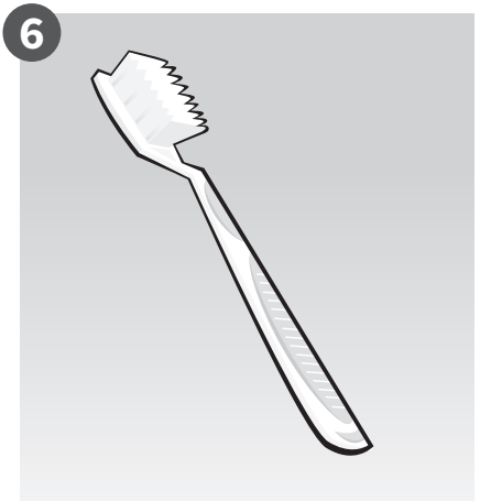
I _____ at _____.