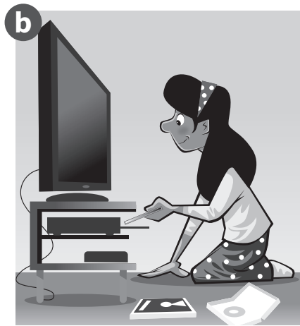
watch a DVD