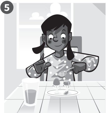
I _____ at _____.