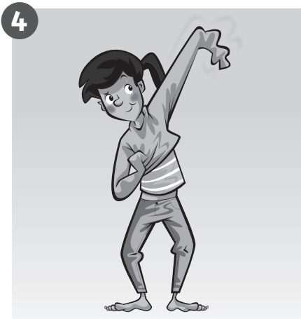
I _____ at _____.