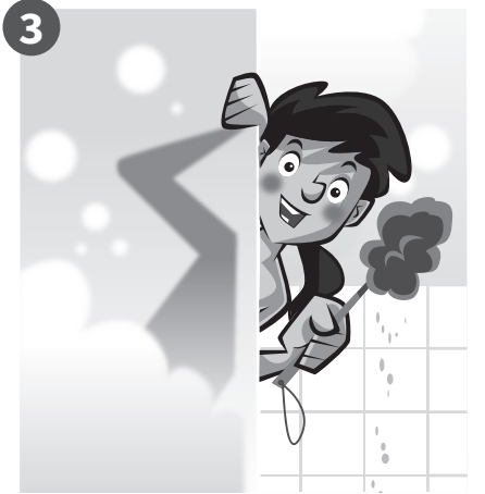
I _____ at _____.