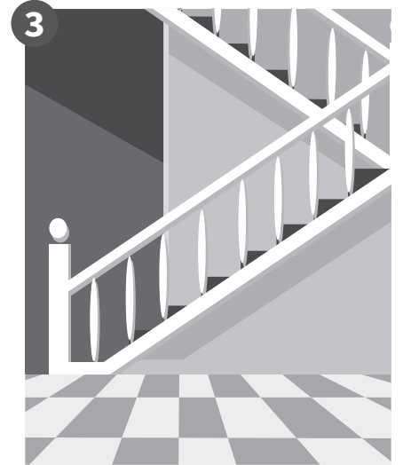
s _ _ _ r s