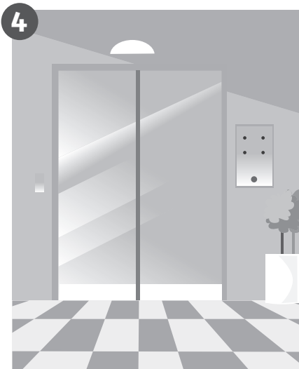
l _ _ t