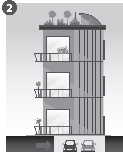
b a _ _ _ n t