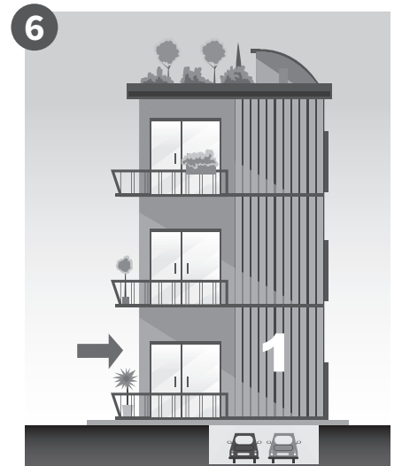
f _ _ _ r