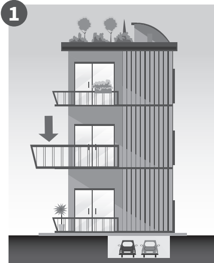
b a l c o n y